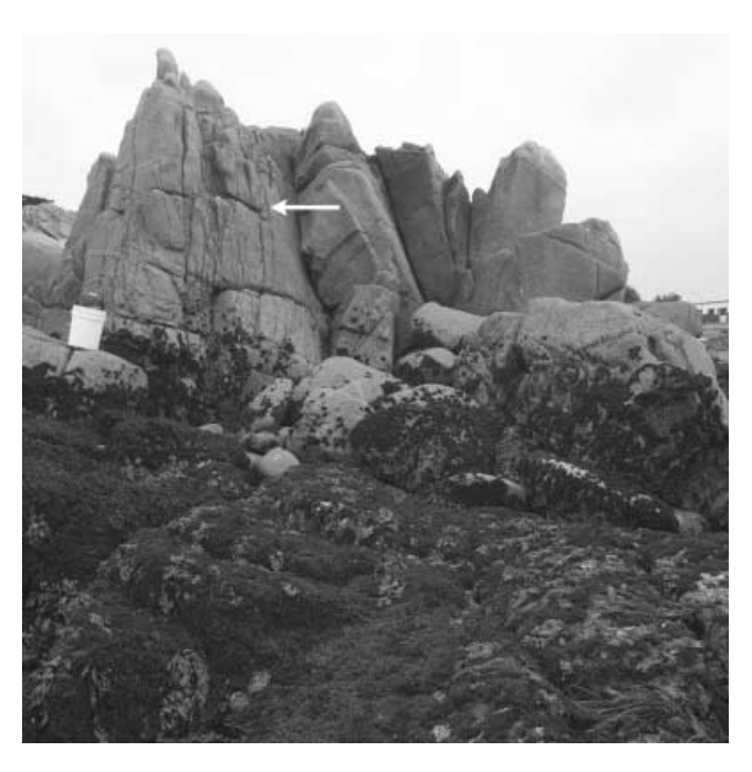
Figure 1. A representative granite promontory at Hopkins Marine Station. Littorina keenae may be found ranging up to the top of this structure, up to 5 m above Mean Lower Low Water (MLLW). The rocks in the foreground are at approximately 1 m above MLLW. The arrow denotes the height at which littorines were collected for this study.

At each of the three sites, for each of three experimental iterations, 50 adult L. keenae with shell length (tip of spire to farthest growing edge of the aperture) of at least 7 mm, were collected. Snails were collected from a 1 m<sup>2</sup> area on the rock face, approximately 3 m above MLLW at each site, and returned to the laboratory for tagging. Each shell was coated with brightly-coloured acrylic nail polish to facilitate subsequent location in the field. We also affixed an individually numbered tag onto each shell using cyanoacrylate glue. A final coat of clear nail polish provided protection against abrasion and UV fading of the ink and coloured nail polish. Tags were printed on plastic-based paper (HP® LaserJet tough paper, 5 mil thickness) in 6-point font. Tag dimensions were approximately 3 mm by 5 mm, as small as possible in order to minimize added drag.